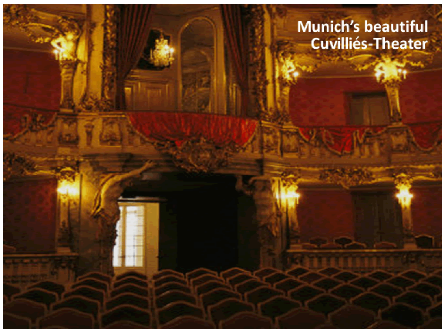
Munich's beautiful Cuvilliés-Theater

Although in-wall loudspeakers is growing as a category within CI, they still have the power to really lift even the highest of high-end installations.