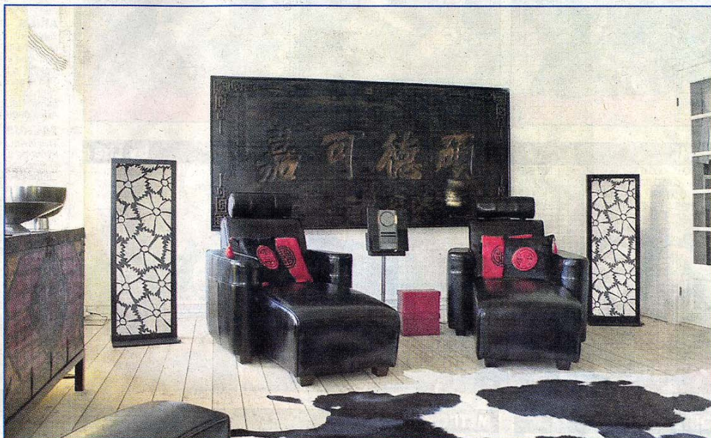
Hidden agendas: Artcoustic’s loudspeakers (pictured on either side of the chairs) double as attractive decorative screens

If I can’t make the show, where can I go? www.amina.co.uk