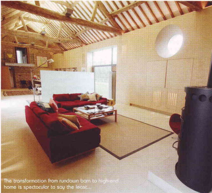
The transformation from rundown barn to high-end home is spectacular to say the least...