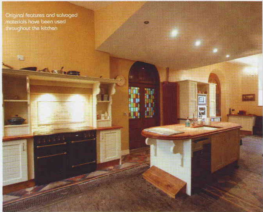
Original features and salvaged materials have been used throughout the kitchen

R egardless of whether you're a fervent believer or a resolute atheist, it's hard to deny that there's something uniquely powerful and humbling about religious architecture. Many of the churches that dot the landscapes of Britain are still standing centuries after they were originally built, often using antiquated construction methods that could be brutal on those that did the heavy lifting back in the day. In contrast to the philosophy that seems to inform so many of today's modern buildings, these ageing houses of worship were truly built to last.