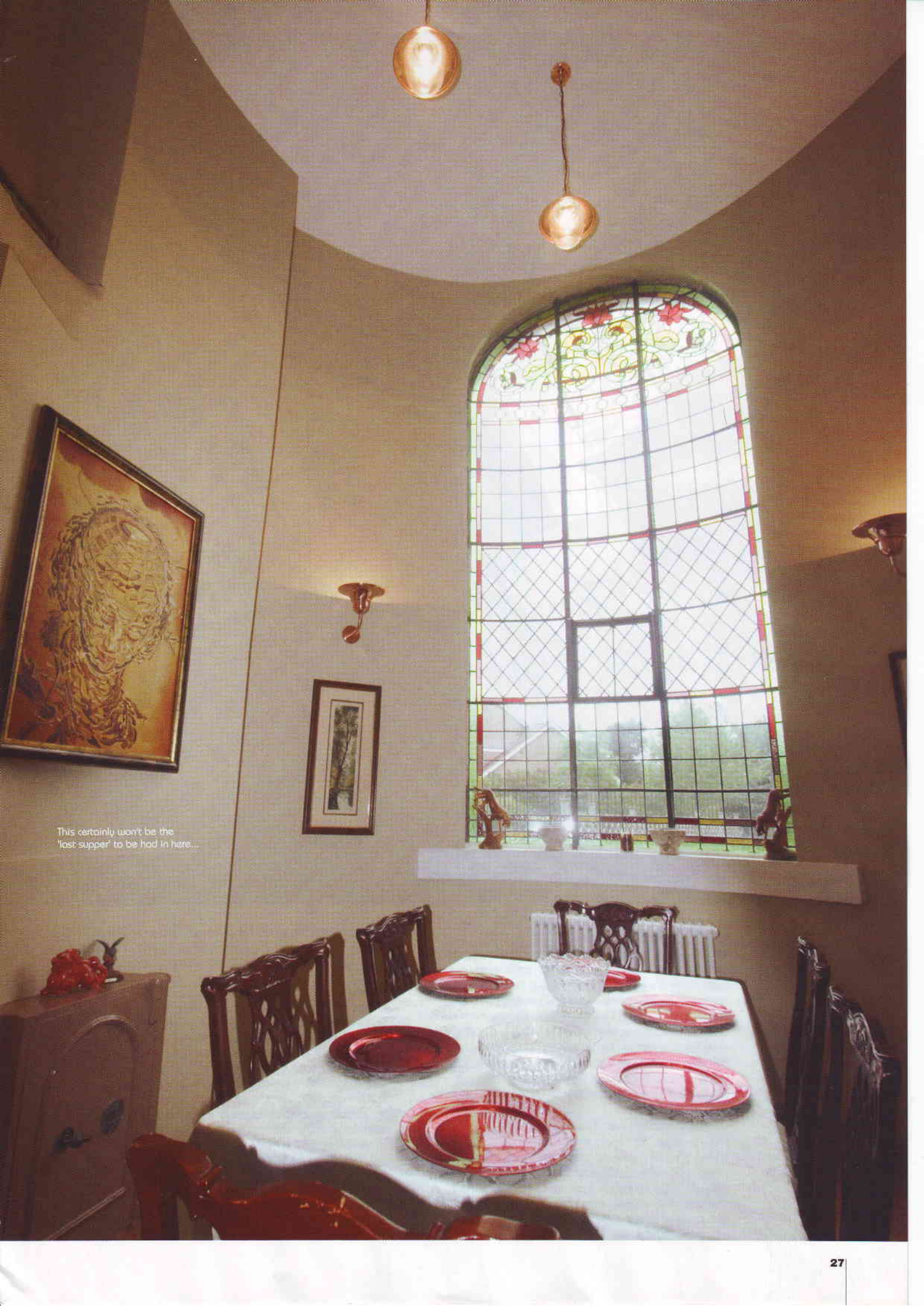
This certainly won't be the "lost supper" to be had in here...