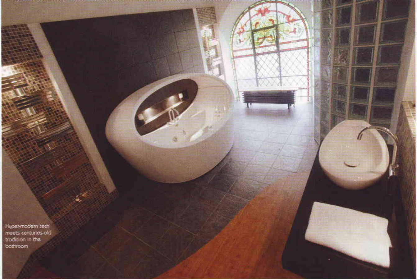
Hyper-modern tech meets centuries-old tradition in the bathroom