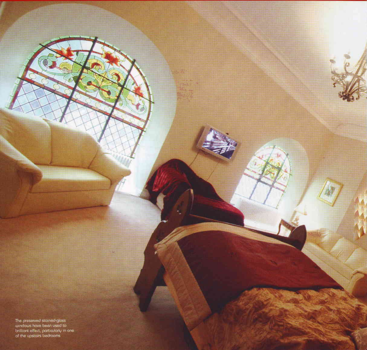
The preserved stained-glass windows have been used to brilliant effect, particularly in one of the upstairs bedrooms